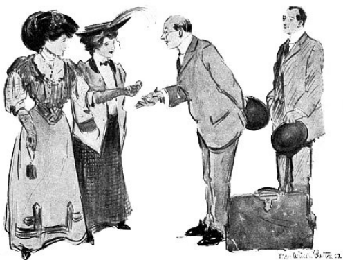
"Mrs. Fenelby handed Kitty's baggage-checks to Tom"