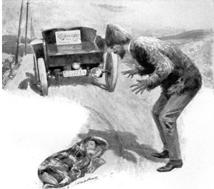
BETWEEN THE FOLDS OF THE BLANKET PEEPED THE FACE OF A SLEEPING CHILD

Suddenly, however, he became aware of a small black spot far ahead in the very middle of the unencumbered track. As he drew near it looked like a great stone. He swerved as he passed it, and, looking, saw that it was a bundle wrapped in a striped blanket. It seemed so odd that it should be lying there that, his curiosity being aroused, he pulled up and walked back a few yards to examine it. The nearer he approached the less did it resemble an ordinary bundle. He bent down, and lo! between the folds of the blanket peeped the face of a sleeping child.