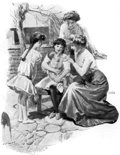
ONE OF THE LITTLE GIRLS IN PIGTAILS WAS HOLDING HIM, WHILE MISS ANNE ADMINISTERED THE FEEDING-BOTTLE

She laughed, holding the feeding-bottle. "The Palace of the Popes has been standing for six centuries, and it will be still standing to-morrow; whereas Jean——" Here Jean, for some reason known to himself, grinned wet and wide. "Isn't he the most fascinating thing of the twentieth century?" she cried, logically inconsequential, like most of her sex. "You go to Marseilles, M. Pujol."