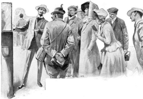
HE MUST HAVE DEALT OUT PARALYZING INFORMATION

Aristide, letting loose his swift imagination, explained copiously, and hypnotized M. Bocardon with his glittering eye, until he had assured to himself a means of livelihood. From that moment he became the familiar genius of the hotel. Scorning the title of "guide," lest he should be associated in the minds of the guests with the squalid scoundrels who infest the Boulevard, he constituted himself "Directeur de l'Agence Pujol." An obfuscated Bocardon formed the rest of the agency and pocketed a percentage of Aristide's earnings, and Aristide, addressed as "Director" by the Anglo-Saxons, "M. le Directeur" by the Latins, and "Herr Direktor" by the Teutons, walked about like a peacock in a barn-yard.