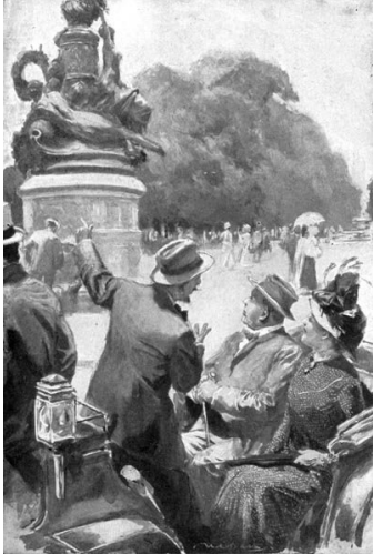
HE MIGHT AS WELL HAVE POINTED OUT THE MARVELS OF KUBLA KHAN'S PLEASURE-DOME TO A COUPLE OF GUINEA-PIGS

He entered the waiting victoria. His wife meekly followed.