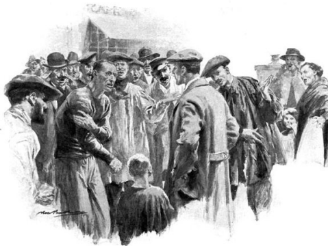
HAD KNOCKED HIM DOWN ON PURPOSE. HE WAS CRIPPLED FOR LIFE

boy's, his lined, clean-shaven face as rigid as a gargoye; and the back of his neck, above the low collar of his jersey, showed itself seamed into glazed irregular lozenges, like the hide of a crocodile. He cursed me and my kind healthily in very bad French and apostrophized his friends in Provençal, who in Provençal and bad French made responsive clamour. I had knocked him down on purpose. He was crippled for life. Who was I to go tearing through peaceful towns with my execrated locomotive and massacring innocent people? I tried to explain that the fault was his, and that, after all, to judge by the strength of his lungs, no great damage had been inflicted. But no. They would not let it go like that. There were the gendarmes—I looked across the square and saw two gendarmes striding portentously towards the scene—they would see justice done. The law was there to protect poor folk. For a certainty I would not get off easily.