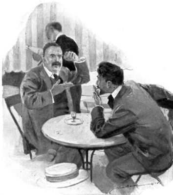
"THE VILLAIN WAS A TRAVELLER IN BUTTONS—BUTTONS!"

It was a crude, flaming, reprehensible, and entirely damning epistle. Aristide turned cold, shivering at the idea of the superb and dainty Zette coming in contact with such abomination. He hated Bondon with a murderous hate. He drank a great gulp of absinthe and wished it were Bondon's blood. Great tears rolled down Bocardon's face, and gathering at the ends of his scrubby moustache dripped in splashes on the marble table.