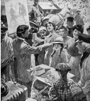
HE DEMONSTRATED THE PROPER APPLICATION OF THE CURE