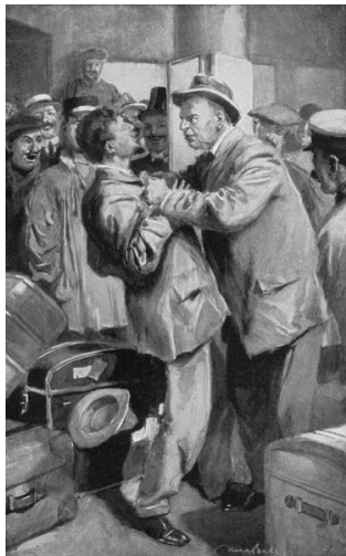
MR. DUCKSMITH SEIZED HIM BY THE LAPELS OF HIS COAT

"Give her to me! Give her to me, I say! She won't regret it."