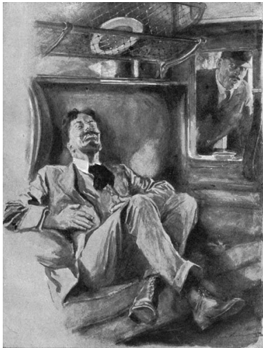
HE BURST INTO SHRIKS OF LAUGHTER

" Tant mieux . I shall find him either at Tarascon or Avignon. And by the Tarasque of Sainte-Marthe, I'll bring you his head and you can put it up outside as a sign and call the place the 'Hôtel de la Tête Bondon.'"