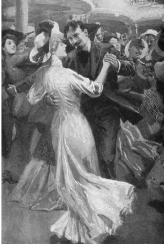
FLEURETTE DANCED WITH ARISTIDE, AS LIGHT AS AN AUTUMN LEAF TOSSED BY THE WIND

"A fortnight ago she was being killed in a Bloomsbury boarding-house. There were two of 'em—she and a girl called Carrie. I used to call 'em Fetch and Carrie. This one was Fetch. Well, she fetched me, didn't you, old girl? And now you're Mrs. Reginald Batterby, living at your ease, eh?"