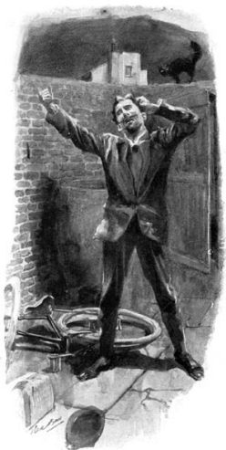
"I FOUND BOTH TYRES HAD BEEN PUNCTURED IN A HUNDRED PLACES"

Indeed, speaking from affectionate knowledge of the man, I can declare that the position in which he, like many a better man, had placed himself was intolerable. Other men of equal sensitiveness would have extricated themselves in a more commonplace fashion; but the dramatic appealed to my rascal, and he has often plumed himself on his calculated coup de théâtre at the fork of the roads. He was delighted with it. Even now I sometimes think that Aristide Pujol will never grow up.