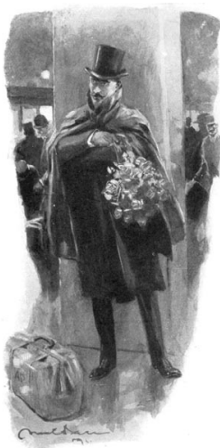
STANDING ON THE ARRIVAL PLATFORM OF EUSTON STATION