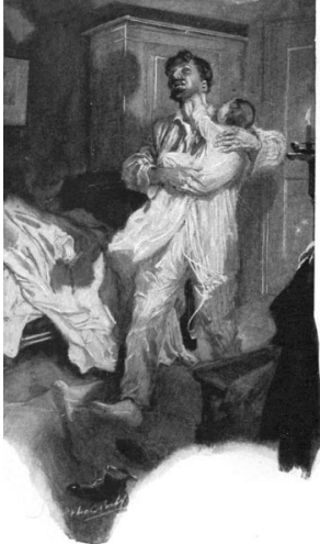
IT IS A FEARSOME THING FOR A MAN TO BE LEFT ALONE IN THE DEAD OF NIGHT WITH A YOUNG BABY

Together they had many wanderings and many adventures. The wheezy, crazy mechanism of the car went to bits in unexpected places. They tobogganed down hills without a brake at the imminent peril of their lives. They suffered the indignity of being towed by wine-wagons. They spent hours by the wayside while Aristide took her to pieces and, sometimes with the help of a passing motorist, put her together again. Sometimes, too, an inn boasted no landlady, only a dishevelled and over-driven chambermaid, who refused to wash Jean. Aristide washed and powdered Jean himself, the landlord lounging by, pipe in mouth, administering suggestions. Once Jean grew ill, and Aristide in terror summoned the doctor, who told him that he had filled the child up with milk to bursting-point. Yet, in spite of heterogeneous nursing and exposure to sun and rain and piercing mistral, Jean thrived exceedingly, and, to Aristide's delight, began to cut another tooth. The vain man began to regard himself as an expert in denticulture.