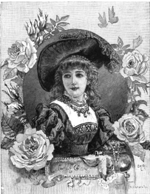
Lady Clare by Alfred Tennyson