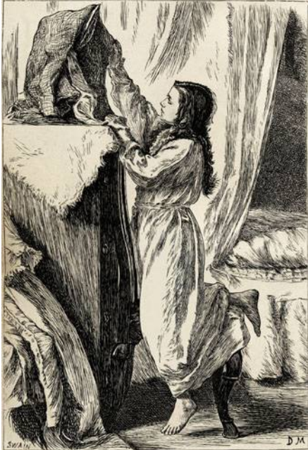
MOLLY'S NEW BONNET. Click to ENLARGE