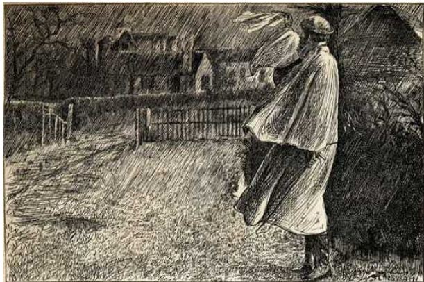
THE LAST TURNING. Click to ENLARGE

She shut the window softly, and shivered all over. She left the attic and went to her own room; but she did not begin to take off her out-of-door things till she heard Cynthia's foot on the stairs. Then she hastily went to the toilet-table, and began to untie her bonnet-strings; but they were in a knot, and took time to undo. Cynthia's step stopped at Molly's door; she opened it a little and said,—"May I come in, Molly?"