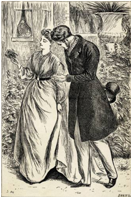
CYNTHIA'S LAST LOVER. Click to ENLARGE

"Molly, tell me! Is it too late for me to speak to Cynthia? I came on purpose. Who is that man?"