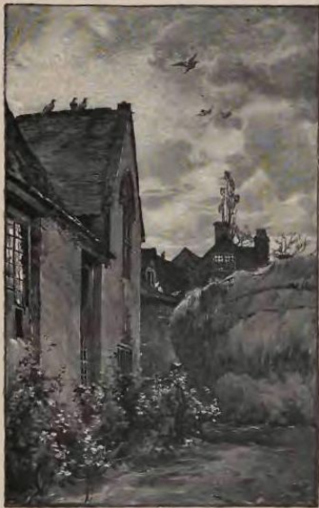
BACK OF THE PRIORY, BROADWAY