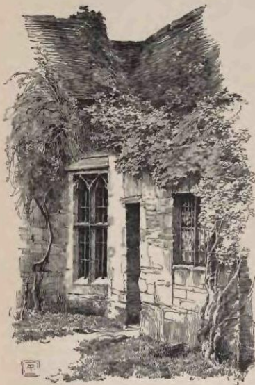
THE OLD HOUSE, "THE PRIORY," BROADWAY, USED AS A STUDIO BY MILLET AND ABBEY

The best work that Mr. Abbey has done is to be found in the succession of illustrations to "She Stoops to Conquer;" here we see his happiest characteristics and—till he does something still more brilliant—may take his full measure. No work in black and white in our time has been more truly artistic, and certainly no success more unqualified. The artist has given us an evocation of a social state to its smallest details, and done it with an unsurpassable lightness of touch. The problem was in itself delightful—the accidents and