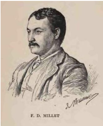
F. D. MILLET

It is characteristic of Mr. Frank Millet's checkered career, with opposites so much mingled in it, that such work as he has done for Harper should have had as little in common as possible with midland English scenery. He has been less a producer in black and white than a promoter and, as I may say, a protector of such production in others; but none the less the back volumes of Harper testify to the activity of his pencil as well as to the variety of his interests. There was a time when he drew little else but Cossacks and Orientals, and drew them as one who had good cause to be vivid. Of the young generation he was the first to know the Russian plastically, especially the Russian soldier, and he had paid heavily for his acquaintance. During the Russo-Turkish war he was correspondent in the field (with the victors) of the New York Herald and the London Daily News —a capacity in which he made many out-of-the-way, many precious,