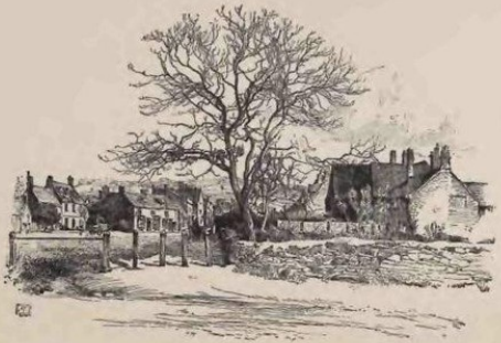
THE VILLAGE GREEN, BROADWAY

could easily prove if it did not perversely happen that he has commemorated most of his impressions in color. That excludes them from the small space here at my command; otherwise I could testify to the identity of old nooks and old objects, those that constitute both out-of-door and in-door furniture.