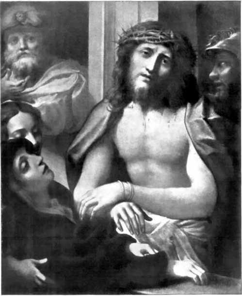
ECCE HOMO National Gallery, London

Please click on the image for a larger image.