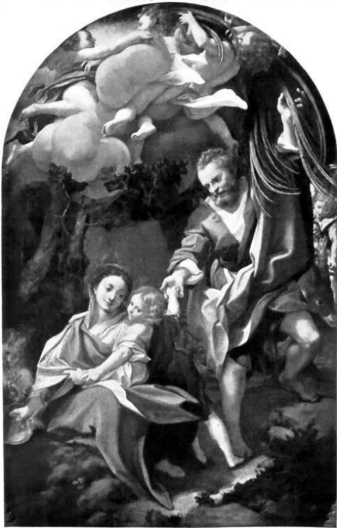
THE REST ON THE RETURN FROM EGYPT (MADONNA DELLA SCODELLA)