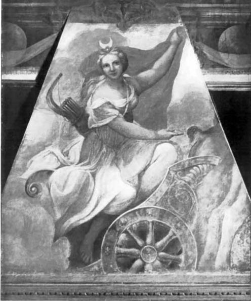
DIANA Convent of S. Paolo, Parma

Please click on the image for a larger image.