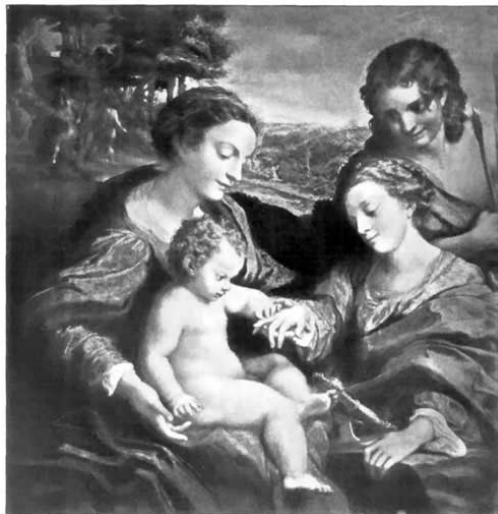
THE MARRIAGE OF ST. CATHERINE The Louvre, Paris

bridegroom performs his part with delight. He holds the precious circlet between the thumb and forefinger of his right hand, and with his left singles out St. Catherine's ring finger. The bride's hand rests on the mother's open palm, held beneath as a support.