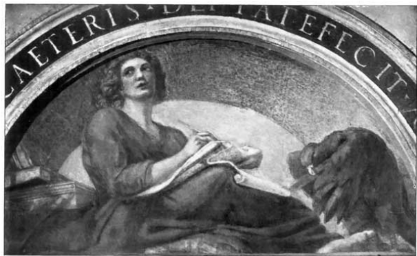
ST. JOHN THE EVANGELIST Church of S. Giovanni Evangelista, Parma

Before considering the frescoes of the cupola, the visitor to the church likes to pause before the lunette over the door of the left transept. The subject is St. John, seated with his writing materials on his lap. There is a pile of books behind him and a volume beside him. At his feet stands the symbolic eagle pluming his wing.