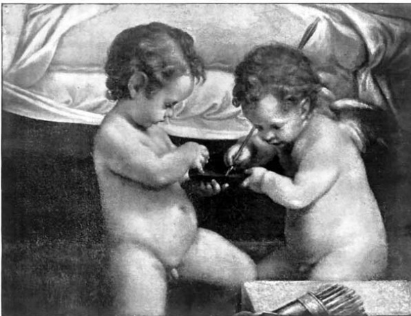
CUPID SHARPENING HIS ARROWS (DETAIL OF DANAË) Borghese Gallery, Rome

Please click on the image for a larger image.