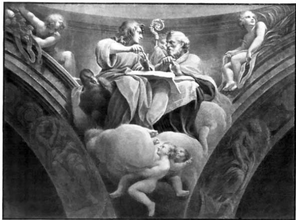
ST. JOHN AND ST. AUGUSTINE Church of S. Giovanni Evangelista, Parma

Please click on the image for a larger image.