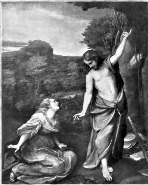
CHRIST APPEARING TO MARY MAGDALENE IN THE GARDEN (NOLI ME TANGERE) Prado Gallery, Madrid

Please click on the image for a larger image.