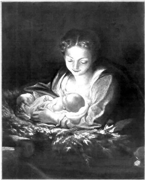
THE HOLY NIGHT (DETAIL) Dresden Gallery

honor to the new-born king. These homely visitors are gathered about the manger in Correggio's picture. The dark night is without, but a dazzling white light shines from the Holy Child.