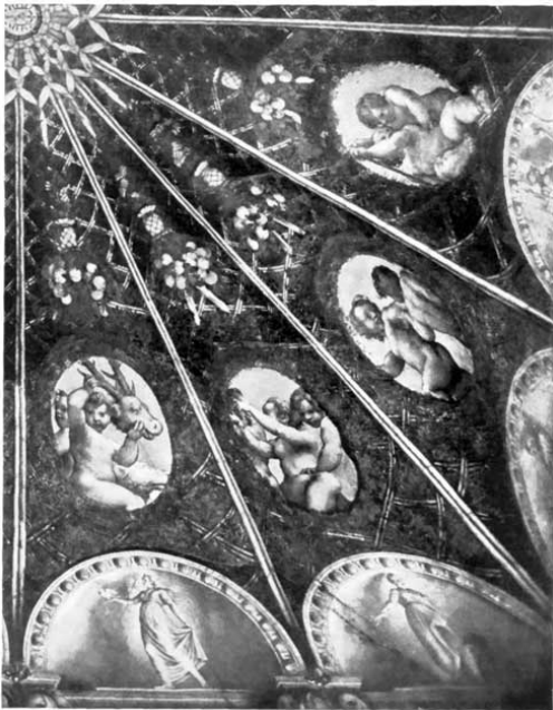
CEILING DECORATION IN THE SALA DEL PERGOLATO Convent of S. Paolo, Parma

Please click on the image for a larger image.