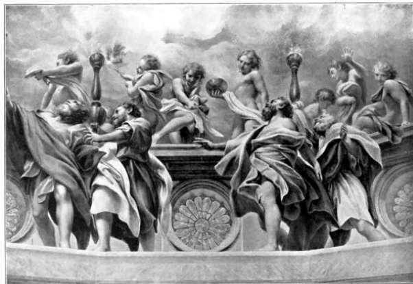
APOSTLES AND GENII Cathedral, Parma

Paul, or to identify any particular persons. Evidently it was not the intention of the artist to distinguish individuals. All the figures are turned with lifted faces towards the vision in the dome. Each expresses, by a gesture, the wonder, joy, rapture, or admiration aroused by the spectacle. Their attitudes are somewhat extravagant and self-conscious. The drapery, too, is rather fantastic, flung about their figures, leaving arms and legs bare. Were the picture taken out of its surroundings it would scarcely suggest a Christian subject. These colossal beings are like Titans moving through the figures of a sacred dance, and murmuring the mystic incantations of some heathen rite.