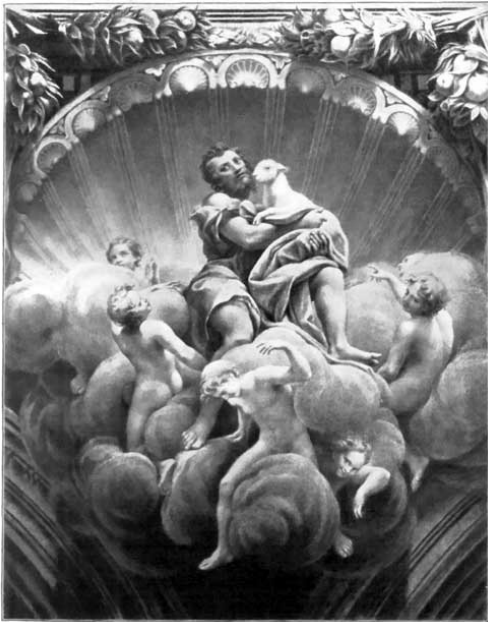
ST. JOHN THE BAPTIST Cathedral, Parma

Please click on the image for a larger image.