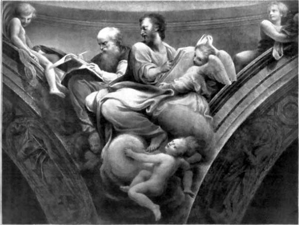
ST. MATTHEW AND ST. JEROME Church of S. Giovanni Evangelista, Parma

Please click on the image for a larger image.