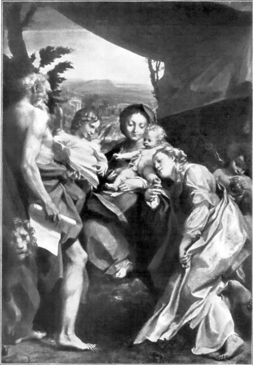
THE MADONNA OF ST. JEROME Parma Gallery

Please click on the image for a larger image.