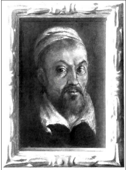
A SUPPOSED PORTRAIT OF CORREGGIO Parma Gallery

Please click on the image for a larger image.