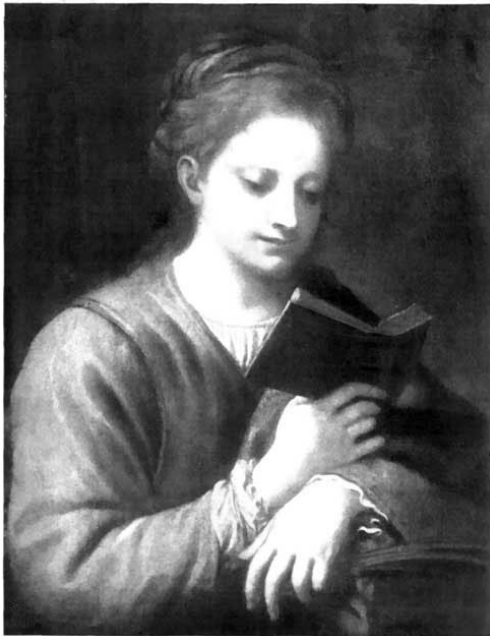
ST. CATHERINE READING Hampton Court Gallery, London

Please click on the image for a larger image.