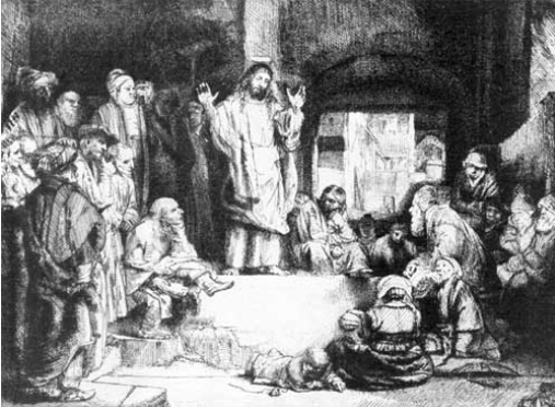
CHRIST PREACHING Museum of Fine Arts, Boston

Please click on the image for a larger image.