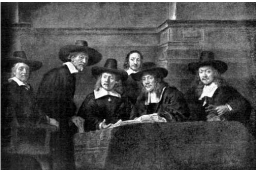
THE SYNDICS OF THE CLOTH GUILD