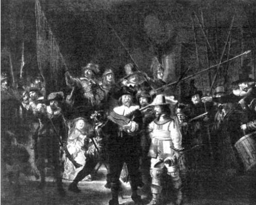
SORTIE OF THE CIVIC GUARD Ryks Museum, Amsterdam

Please click on the image for a larger image.