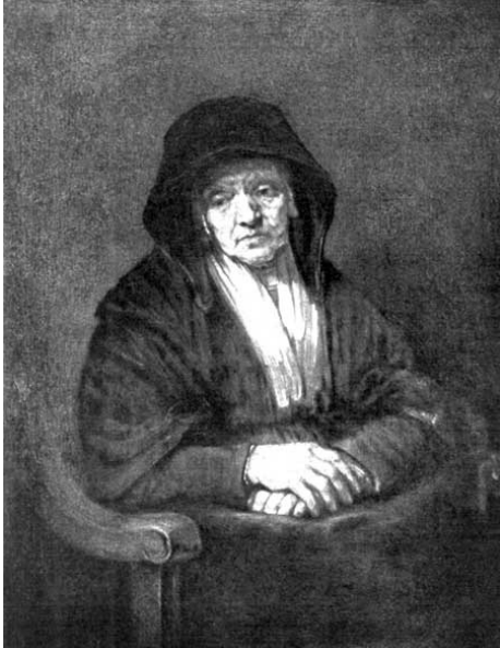
PORTRAIT OF AN OLD WOMAN Hermitage Gallery, St. Petersburg

Please click on the image for a larger image.