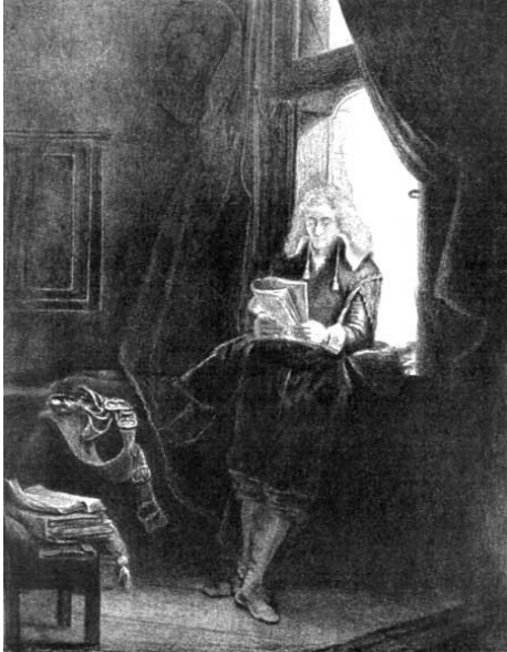
PORTRAIT OF JAN SIX Museum of Fine Arts, Boston

Please click on the image for a larger image.