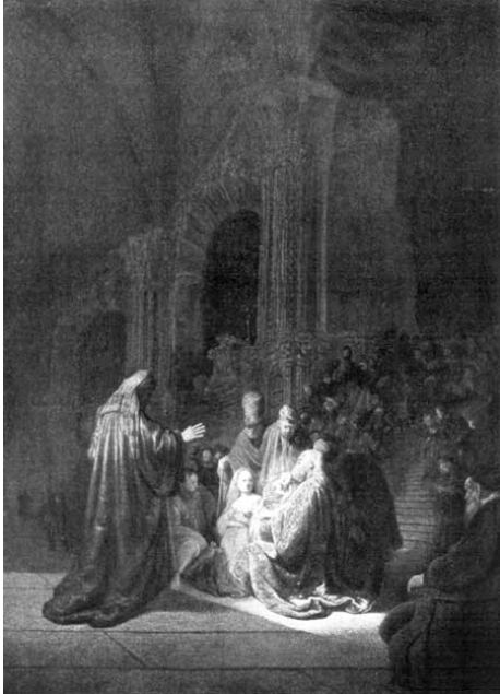
THE PRESENTATION IN THE TEMPLE The Hague Gallery

Please click on the image for a larger image.