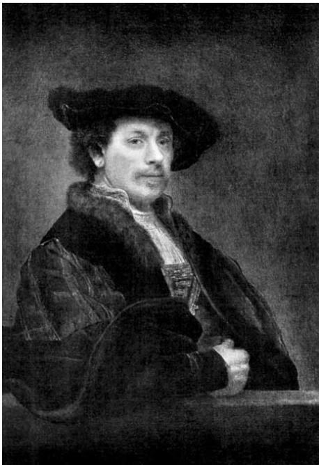
REMBRANDT VAN RYN (BY HIMSELF) National Gallery, London

Please click on the image for a larger image.