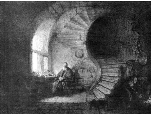
THE PHILOSOPHER IN MEDITATION The Louvre, Paris

Please click on the image for a larger image.