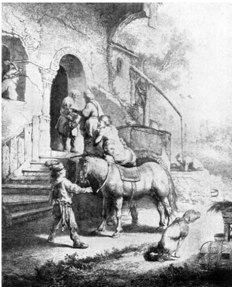
THE GOOD SAMARITAN Museum of Fine Arts, Boston