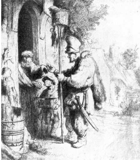
THE RAT KILLER Museum of Fine Arts, Boston

Please click on the image for a larger image.