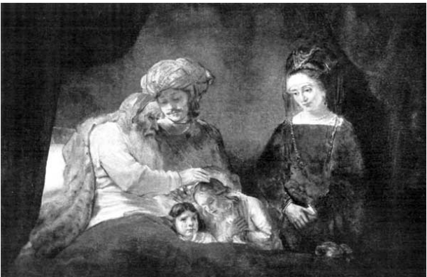
ISRAEL BLESSING THE SONS OF JOSEPH Cassel Gallery

Please click on the image for a larger image.