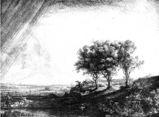
THE THREE TREES Museum of Fine Arts, Boston

Please click on the image for a larger image.