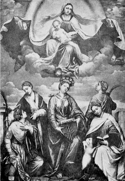
Moretto.—Madonna in Glory.