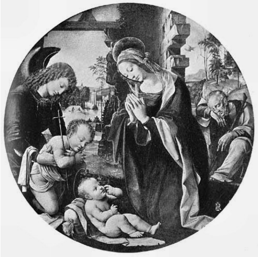
Lorenzo di Credi.—Nativity.

Passing from the sculpture of Florence to its painting, it is fitting that we mention first of all the friend and fellow-pupil of the Umbrian Perugino, Lorenzo di Credi. The two had much in common. Trained together in the workshop of the sculptor Verrocchio, in those days of intense religious stress, they both became followers of the prophet-prior of San Marco, Savonarola. Their religious earnestness naturally found expression in the beautiful subject of the Madre Pia. The Florentine artist, though not less devout than his friend, introduces into his work an element of joy, characteristic of his surroundings, and more attractive than the somewhat melancholy types of Umbria. His Adoration, in the Uffizi, is an admirable example of his best work.