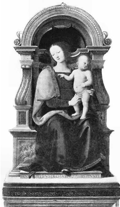
Perugino.—Madonna and Saints. (Detail.)

Bartolommeo was specially successful in the subject of the enthroned Madonna, having fine gifts of composition united with profound