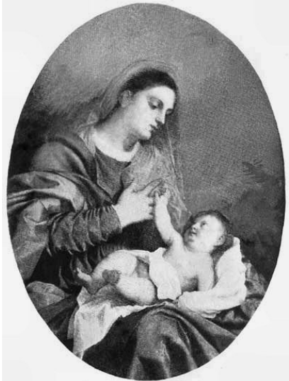
Titian.—Madonna and Saints. (Detail.)

Another similar composition reveals a still sweeter intimacy between mother and son. The babe stretches out his hand coaxingly towards his mother's breast, but she draws her veil about her, gently denying his appeal. A more beautiful mother, or a more bewitching babe, it were hard to find. Three fine half-length figures of saints complete this composition, each of great interest and individuality, but not necessary to the unity of action—the Madonna alone making a complete picture. There are two copies of this work, one in the Belvedere at Vienna, and one in the Louvre at Paris.