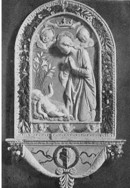
Andrea della Robbia.--Madonna in Adoration.

Only second in popularity to this was Andrea's circular medallion of the Nativity, with the Virgin and St. John in adoration. There are two copies of this in the Florentine Academy, one in the Louvre, and one in Berlin. The effect of crowding so many figures into a small compass is not so pleasing as the classical simplicity of the former composition.