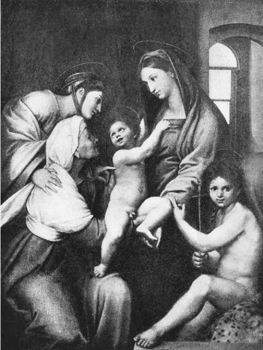
Raphael.--Madonna dell' Impannata.

Please click here for a modern color image