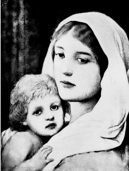
Gabriel Max.—Madonna and Child.

As the portrait picture was the first style of Madonna known to art, so, also, it is the last. By a leap of nearly a thousand years, we have returned, in our own day, to the method of the tenth century. It is strange that what was once a matter of necessity should at last become an object of choice. In the beginning of Madonna art, the limited resources of technique precluded any attempts to make a more elaborate setting. Such difficulties no longer stand in the way, and where we now see a portrait Madonna, the artist has deliberately discarded all accessories in order better to idealize his theme.