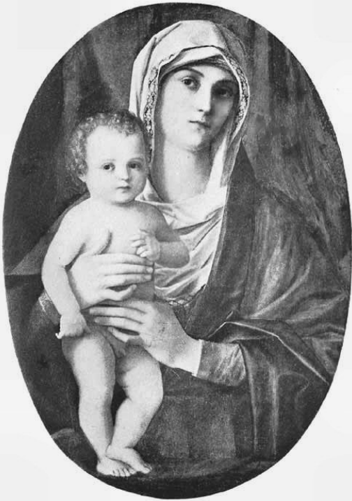
Giovanni Bellini.—Madonna between St. George and St. Paul. (Detail.)