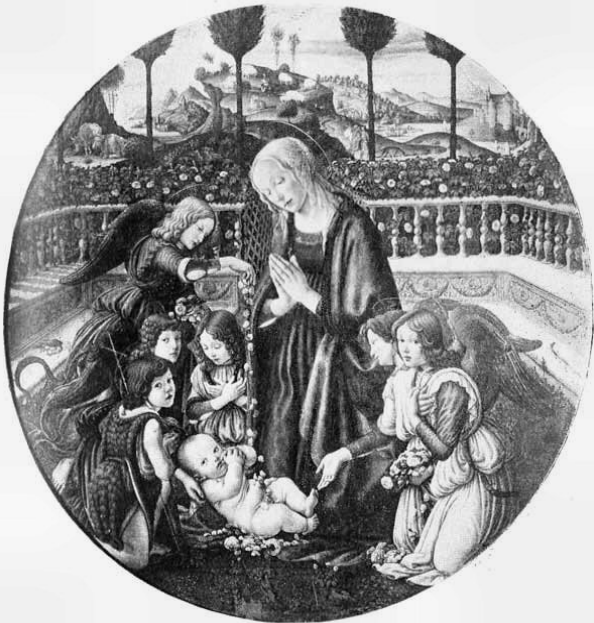
Filippino Lippi.--Madonna in a Rose Garden.

The subject of the Santa Conversazione should not be left without a brief reference to other Venetians, who added to the popularity of this charming style of picture. Berenson mentions seven by Palma's pupil, Bonifazio Veronese, and one by his friend, Lorenzo Lotto. Cima, Cariani, Paris Bordone, and last, but not least, the great Titian, [3] lent their gifts to the subject, so that we have abundant evidence of the