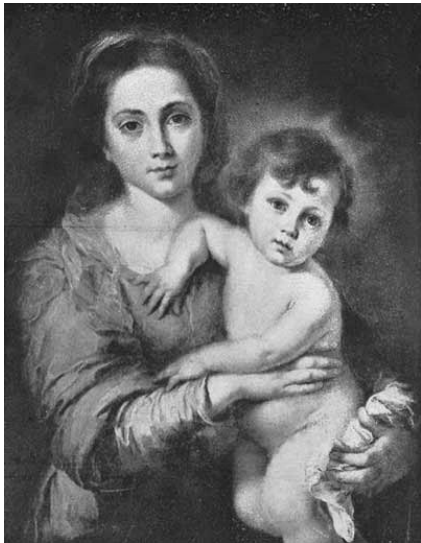
Murillo.--Madonna and Child.