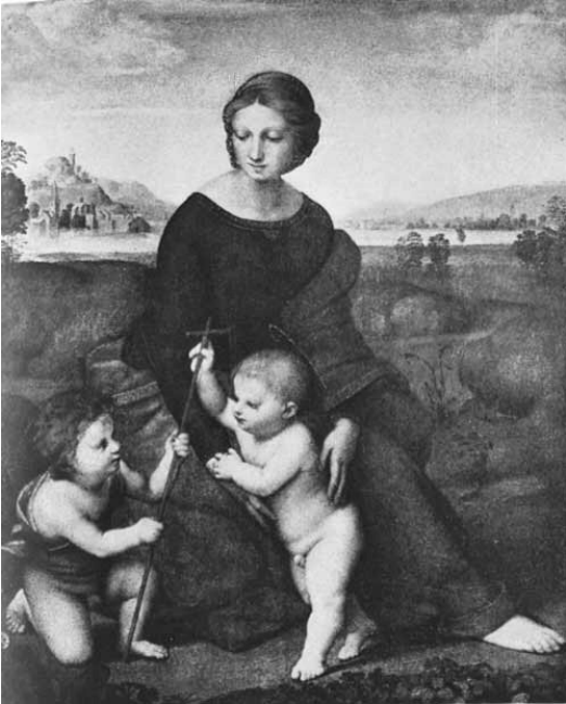
Raphael.—Madonna in the Meadow.

Please click here for a modern color image