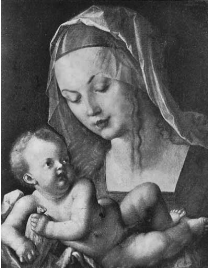
Dürer.—Madonna and Child.

Please click here for a modern color image