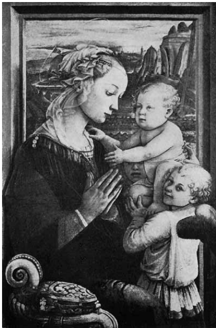
Filippo Lippi.—Madonna in Adoration.

Please click here for a modern color image