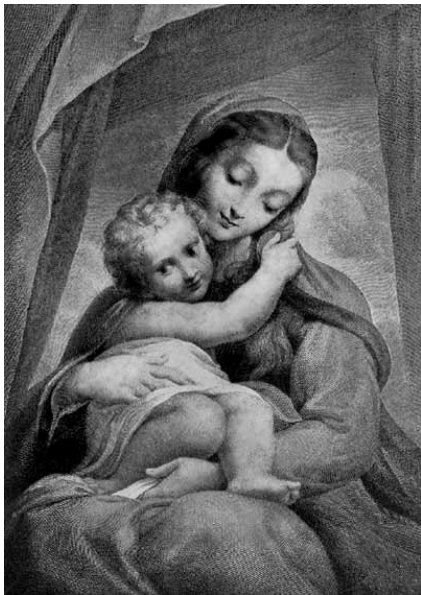
Correggio.—Madonna della Scala.

The name attached itself to the picture even after the church was destroyed (in 1812), and the fresco removed to the town gallery. The marks of defacement which it bears are due to the votive offerings which were formerly fastened upon it,—among them, a silver crown worn by the Madonna as late as the eighteenth century. Though such scars injure its artistic beauty, they add not a little to the romantic