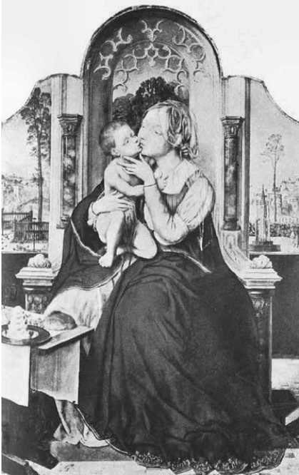
Quentin Massys.—Madonna and Child.

Please click here for a modern color image