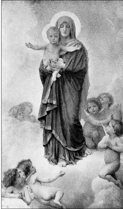
Bouguereau.—Madonna of the Angels.

After the time of Raphael, a pretty form of Madonna in glory was