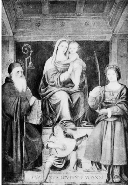
Luini.—Madonna with St. Barbara and St. Anthony.

One could hardly imagine two more dissimilar spirits than Luini and Botticelli. To Luini's Virgin, the consciousness of her son's greatness is a proud honor, accepted seriously, but gladly. To Botticelli, on the other hand, it brings a profound melancholy. This is so marked that at first sight almost every one is repelled by Botticelli, and yields only after long familiarity to the mysterious fascination of the sad-eyed Madonna, who holds her babe almost listlessly, as her head droops