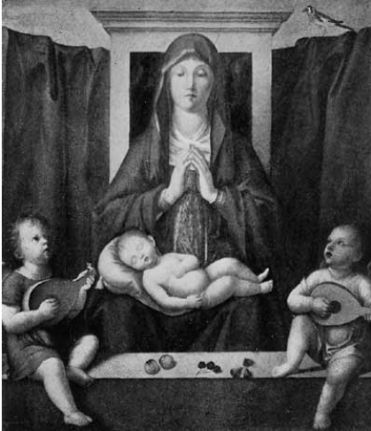
Luigi Vivarini.--Madonna and Child.

Please click here for a modern color image