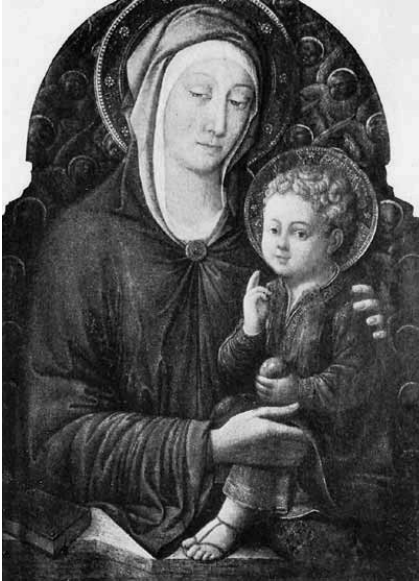
Jacopo Bellini.—Madonna and Child.

Please click here for a modern color image