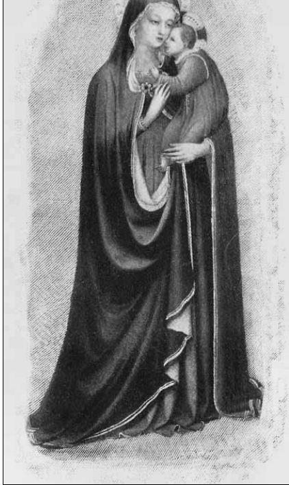
Fra Angelico.--Madonna della Stella.

A single star gleams above her brow, from which is derived the title of the picture. She holds her child fondly, and he, with responsive