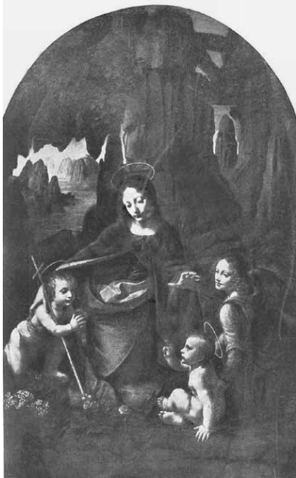
Leonardo da Vinci.—Madonna of the Rocks.

Please click here for a modern color image