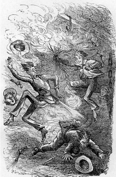
"In two seconds the whole place was in a blaze."

great, and to you important truth, let me show you a thing. Do you see this torch," (taking it down), "and that straw?" (lifting up a handful), "Well, you have no idea what an astonishing result will follow the application of the former to the latter—see!"