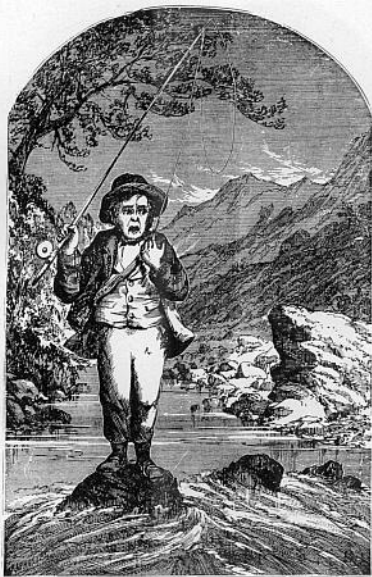
"The rock on which he stood was too narrow to admit of much movement."

f r o m some indescribable manoeuvre to which it had previously been subjected.