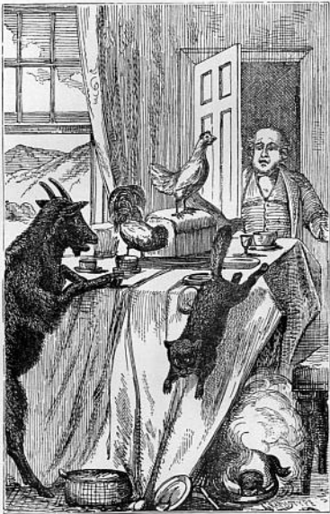
"He was struck absolutely dumb by the amazing 'tableau vivant' that met his vision."

out the crumb of a wheaten loaf. If the latter were the goat's occupation, it must have been charmed beyond expression; for the half of the loaf had been devoured by the audacious trio, and, just at the moment of Mr Sudberry's appearance, the bantam's body was buried over the shoulders, and nothing of it was visible to the horrified master of the house save its tail, appearing over the edge of the loaf.