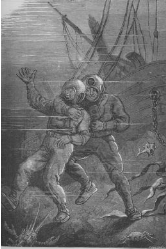
CAUGHT NAPPING.—PAGE 90.

communicate with each other with their voices by bringing their helmets into contact, so that the sound should vibrate through both, he resolved to test this and try an effect. Hooking the lantern to his belt behind, in such a way that its light was concealed, he knelt down beside the diver—who, he had no doubt, was the Jem Hogg mentioned to him by Baldwin—and rested his helmet on the rock, in such a way that the side of it was brought into contact with the back of Jem's head-piece. No sooner did it touch than the snoring became audible. Feeling assured, therefore, of success, our hero drew in a long breath and gave vent to a Red-Indian yell that rendered himself completely deaf.