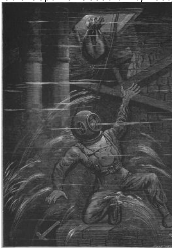
DOWN THE WELL.—PAGE 173.

But here, at a depth of about thirty feet, an unexpected