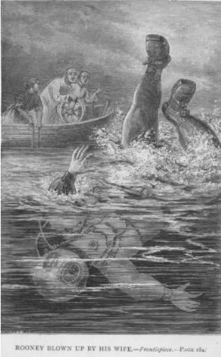
ROONEY BLOWN UP BY HIS WIFE.—Frontispiece.—Page 124.

waves were cleft alongside, and Rooney Machowl came up from the bottom, feet foremost, with a bounce that covered the sea with foam. He had literally been blown up from the bottom—his dress being filled with so much compressed air that he had become like a huge bladder, and despite all his weights, he rolled helplessly on the surface in vain attempts to get his head up and his feet down.