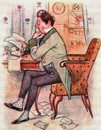
“ Lord Rupert glances over his love letters.”

She nearly laughed her little curly head off when they all went round the house with her, and Peter Piper showed her the holes in the carpet and the stuffing coming out of the sofas, and the feathers out of the beds, and the legs tumbling off the chairs. She had never seen anything like it before.