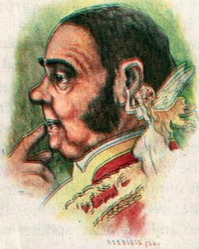
Queen Crosspatch makes the footman remember Cynthia's box

"Oh!" she cried out, "It must be the doll who broke her little leg and was sent to the hospital. It must be Lady Patsy."