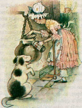
Ridiklis does the cooking.

The Castle dolls were grand beyond words, and they were all lords and ladies. These were their names. There was Lady Gwendolen Vere de Vere. She was haughty and had dark eyes and hair and carried her head thrown back and her nose in the air. There was Lady Muriel Vere de Vere, and she was cold and lovely and indifferent and looked down the bridge of her delicate nose. And there was Lady Doris, who had fluffy golden hair and laughed mockingly at everybody. And there was Lord Hubert and Lord Rupert and Lord Francis, who were all handsome enough to make you feel as if you could faint. And there was their mother, the Duchess of Tidysshire; and of course there were all sorts of maids and footmen and cooks and scullery maids and even gardeners.