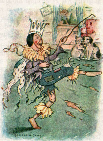
The Duke of Tags.

The day after this another much more exciting thing took place. The nurse was in a bad temper and when she was tidying the nursery she pushed the easy chair aside and saw Racketty-Packetty House.