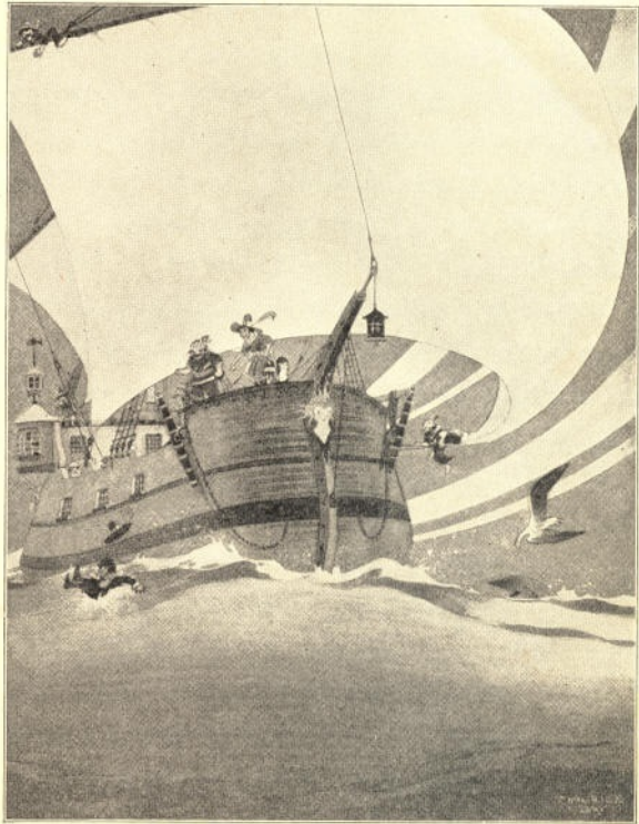
Splash! And the Master Mariner fell into the sea.