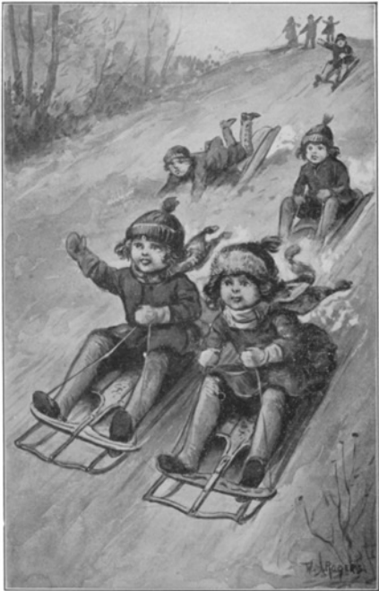
THE CHILDREN HAD GREAT FUN COASTING.

"I never did before," her father said. "It's a new business for me, and I may make a failure of it."