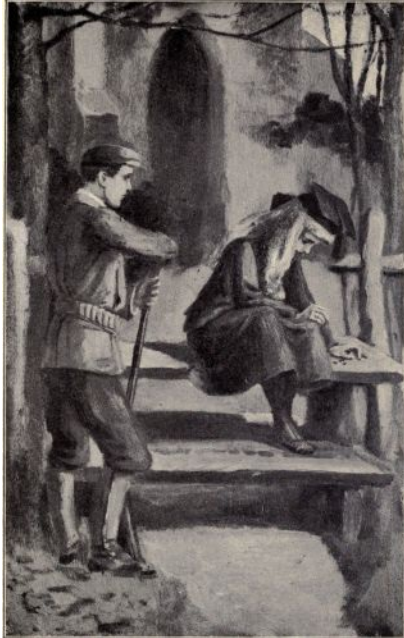
"MALCOLM, LEANING ON HIS GUN, STOOD WATCHING HER."

"It helped Corono ever so much, mother said," remarked Allison. "That's one good thing our Shadow Club led to, if nothing else." She climbed up on the stile and stood looking over, exclaiming at the beauty of the old gray walls, draped in the masses of brilliant bittersweet; then, springing down, ran across the churchyard to join