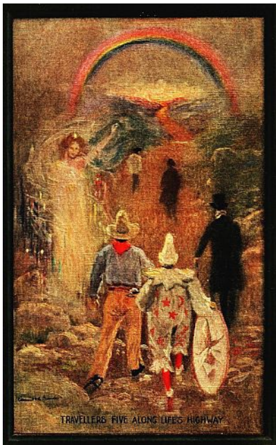
TRAVELLERS FIVE ALONG LIFE'S HIGHWAY