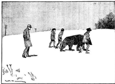
"ACROSS THE SNOWY FIELDS."

Why should the ladies be bothered about a matter that the boys were old enough to decide? So well had he argued, and so tactfully had he flattered them, that when they took their way across the field, it was with the feeling that they were doing their highest duty in getting these homeless wayfarers to the cabin as quickly as possible, on their own responsibility.