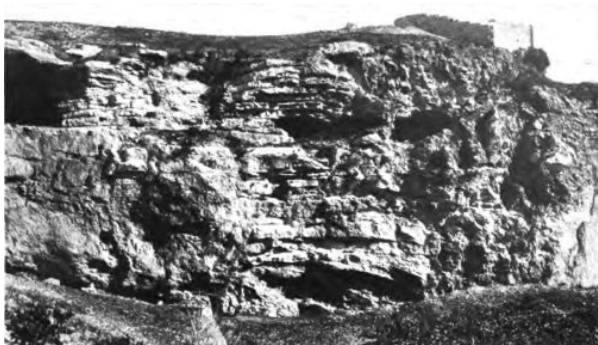
THE TRUE GOLGOTHA—THE PLACE OF THE SKULL

"Golgota! Das richtige Golgota" (the true Golgotha), he said, excitedly, and then I remembered that I should have said Golgotha, the "Place of the Skull," in the beginning.