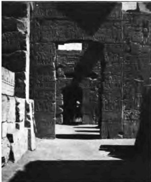
SANCTUARY IN KARNAK