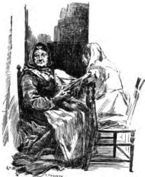
TWO BENT, WRINKLED WOMEN WEAVING LACE OUTSIDE

We told him that we wanted lace. Ah, a smile that was like morning overspread his face. He took us to a large shop, where we found some of our friends already negotiating, but we did not linger. We said we wanted to find a little shop—a place where it was made. He led us to another bazaar. Again we said, "No, a little shop—a very little shop, on a back street."