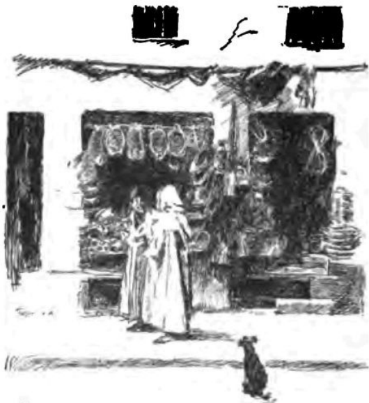
MARVELLOUS BASKETS AND QUEER THINGS

though a down-town palace of Ali Ben Hussein, the final Dey of Algiers—a gaudy wedding-cake affair, all fluting and frosting—was not without interest, especially when we found that the late Hussein had kept his seven wives there. It was a comparatively old building, built in Barbarossa times, the guide said, and now used only on certain official occasions. It is not in good taste, I imagine, even from the Oriental standpoint.