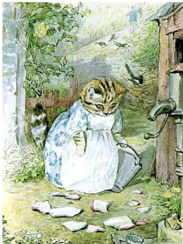
SO THERE REALLY WAS A PATTY-PAN

water to wash up the tea-things, she found a pink and white pie-dish lying smashed in the middle of the yard. The patty-pan was under the pump, where Dr. Maggotty had considerably left it.