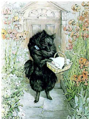
THE VEAL AND HAM PIE

And just at the same time, Duchess came out of her house, at the other end of the village.