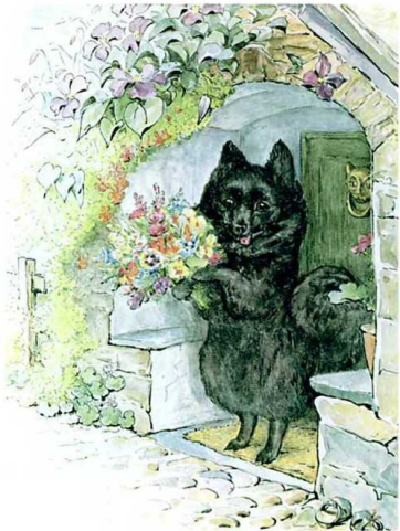
DUCHESS IN THE PORCH

"Quite well, I thank you, and how do you do, my dear Ribby?" said Duchess. "I've brought you some flowers; what a delicious smell of pie!"