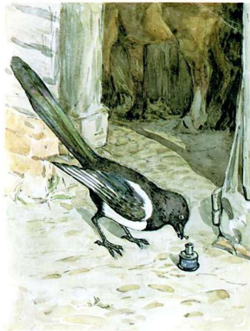
DR. MAGGOTTY'S MIXTURE

"Spinach? ha! HA!" said he, and accompanied her with alacrity.