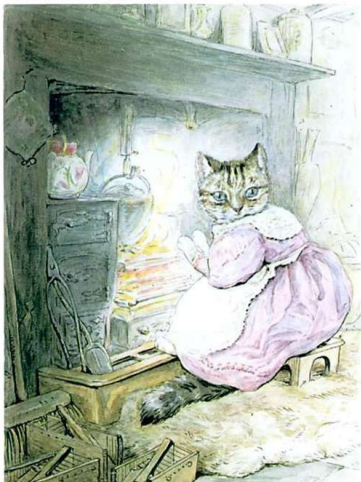
READY FOR THE PARTY

She came downstairs again, and made the tea, and put the teapot on the hob. She peeped again into the bottom oven, the pie had become a lovely brown, and it was steaming hot.