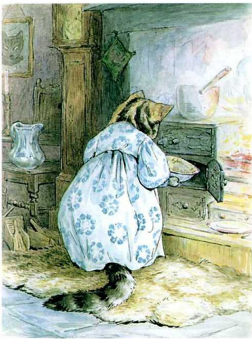
THE PIE MADE OF MOUSE

Ribby put on some coal and swept up the hearth. Then she went out with a can to the well, for water to fill up the kettle.