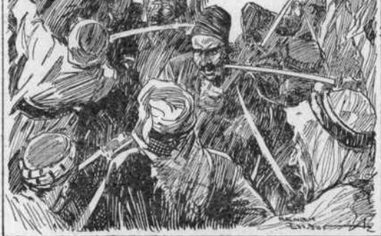
THE DASH FOR THE MACHINE-GUN