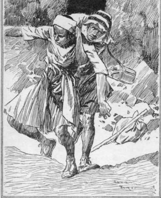
THE STRUGGLE ON THE TELL