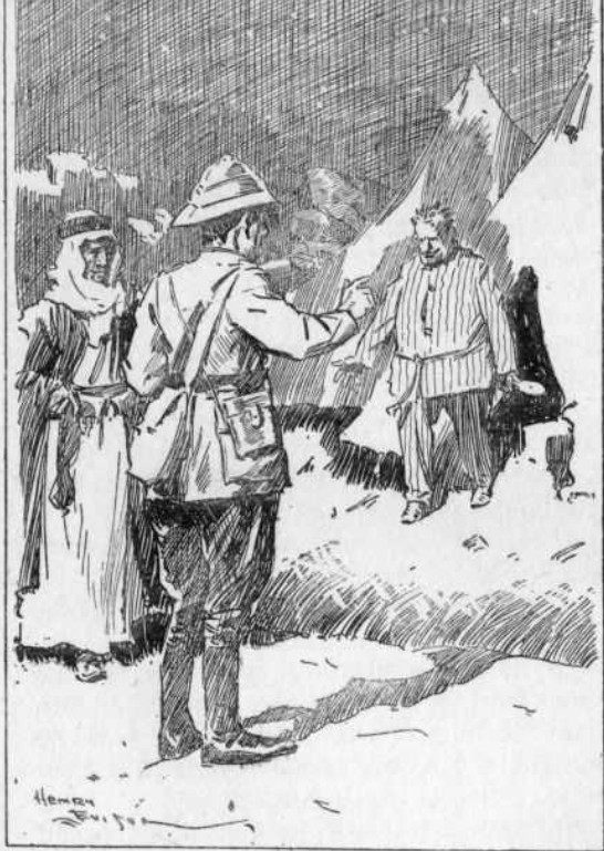
MAJOR BURCKHARDT IS DISTURBED