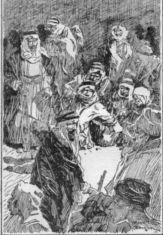
A CAPTIVE IN BONDS