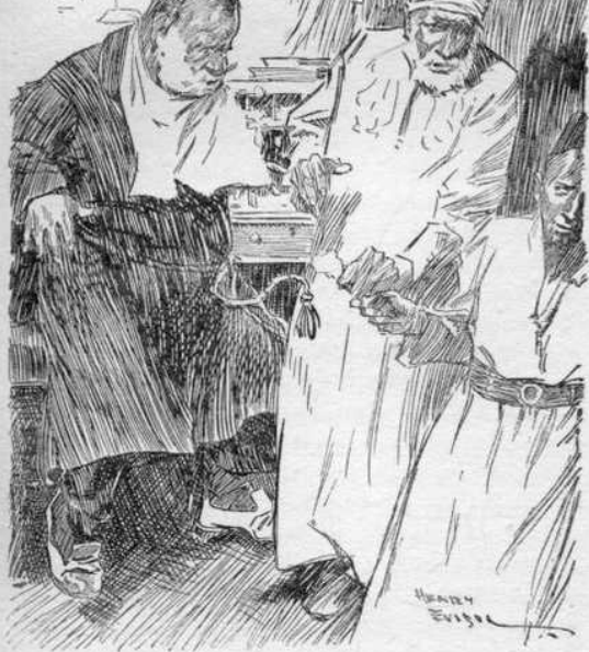
A MOUTHFUL OF SOAP