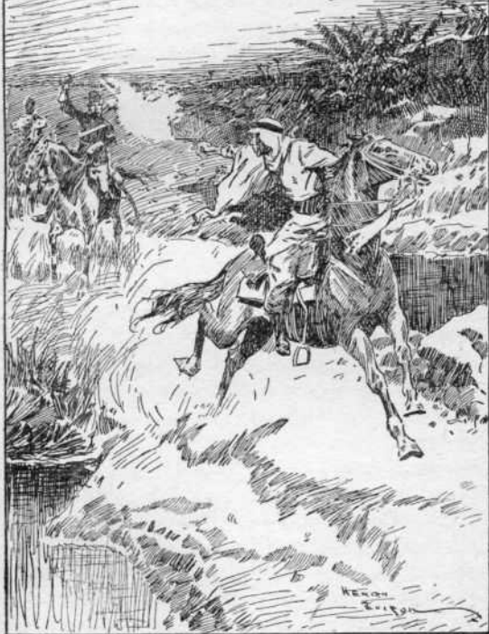
THE LAST SHOT