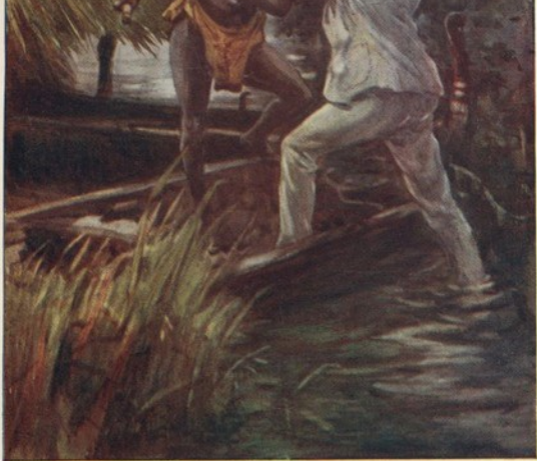
A midnight encounter