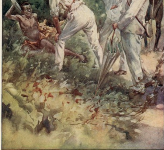
The finding of Samba