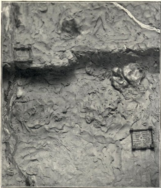
Ilombekabasi and Surrounding Country, showing the Diverted Stream and Elbel's Third Camp