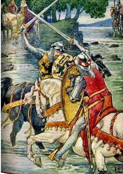
BEAUMAINS WINS THE FIGHT AT THE FORD

Thus they fared until evensong, and then they came to a waste land, where their way led through a narrow darkling valley. And at the head thereof they entered upon a wide land, black and drear to the very skies, and beside the way was a black hawthorn, and thereon hung a black banner and a black shield, and by it, stuck upright, was a long black spear,