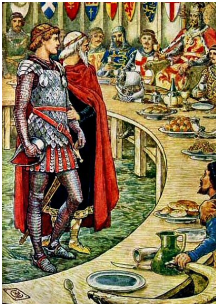
SIR GALAHAD IS BROUGHT TO THE COURT OF KING ARTHUR

'Sir,' said the old man to him, 'wit ye well that that is your seat. For you are he that shall surely achieve the Holy Graal, and such of these your