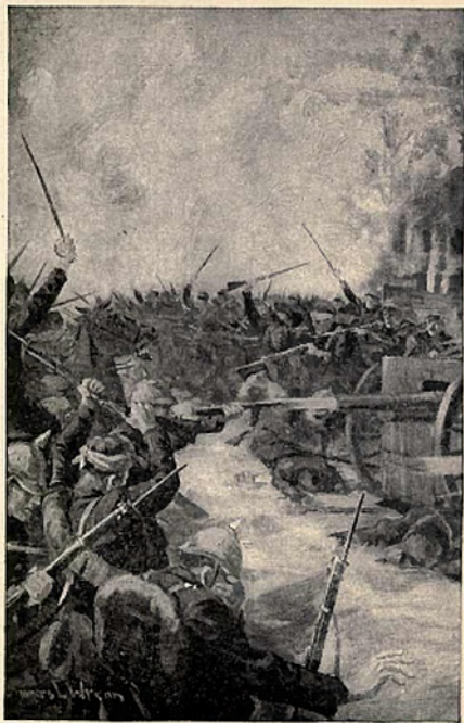
"A French army...had been assailed with fury."