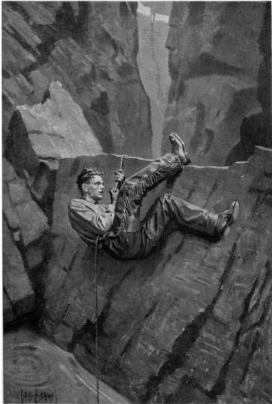
Another desperate clutch at the rope—still another