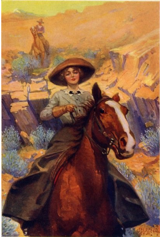
It was a wild race [Page 32]