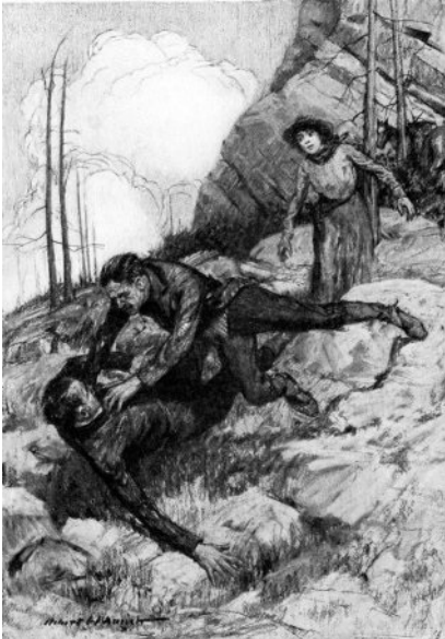
THE SLENDER YOUTH WENT DOWN BEFORE THE BIG RANCHER AS THOUGH STRUCK BY A CATAPULT

Belden snarled between his teeth: "I told you I'd kill you, and I will."