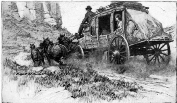
THE GIRL BEHIND HIM WAS A WONDROUS PART OF THIS WILD AND UNACCOUNTABLE COUNTRY

Meanwhile the stage rose and fell over the gigantic swells like a tiny boat on a monster sea, while the sun blazed ever more fervently from the splendid sky, and the hills glowed with ever-increasing tumult of color. Through this land of color, of repose, of romance, the young traveler rode, drinking deep of the germless air, feeling that the girl behind him was a wondrous part of this wild and unaccountable country.