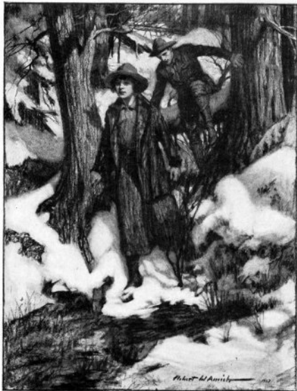
SHE FOUND HERSELF CONFRONTED BY AN ENDLESS MAZE OF BLACKENED TREE-TRUNKS

He bravely reassured her: "I'm not defeated, I'm just tired. That's all. I can go on."