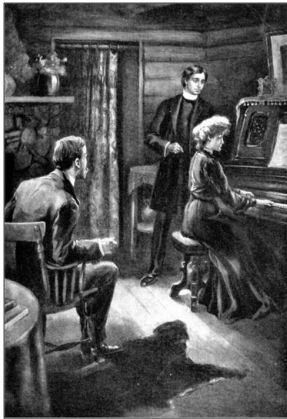
"SERVISS LISTENED WITH GROWING AMAZEMENT"

had ample spread and were under perfect control. There was power in the poise of her head and in the rhythmic swaying of her body, but her playing was curiously unfeminine. There was no touch of girlish grace, of sentiment, in her performance, and with a sudden enlightenment Serviss inwardly exclaimed: "Aha! A clerical Svengali! This musical preacher has trained his pupil till she plays as he would play if he had the digital facility. It's all fine, but it is not the girl," and the question of their relationship again engaged him.