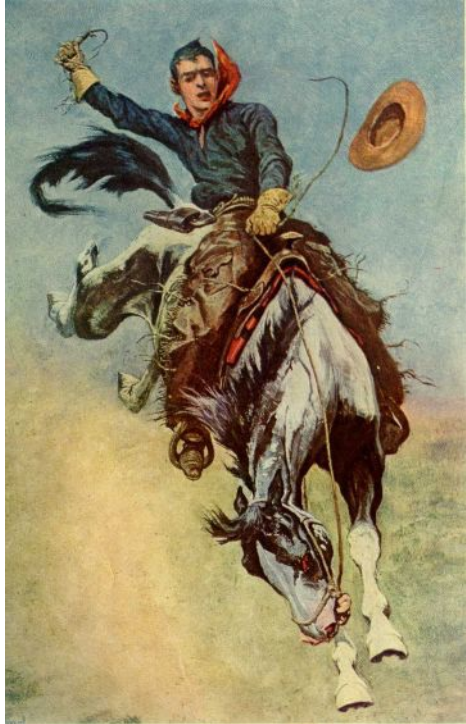
THE RIDIN' KID