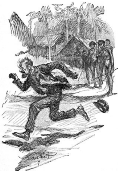
"Captain Scraggs ... broke from the circle

shriek for help. Mr. Gibney whirled with the speed and agility of a panther just in time to dodge a blow from a war club. His fist collided with the jaw of Tabu-Tabu, and down went that savage as if pole-axed.