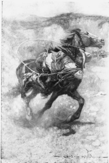
SMITH REACHED FOR THE TRAILING ROPE AND THEY WERE GONE!

With the lightning-like gesture which had made his name a byword where Babe himself was unknown, he pulled his six-shooter from its holster and shot Tubbs through the head. He fell his length, like a bundle of blankets, and, even as he dropped, Babe was in the saddle