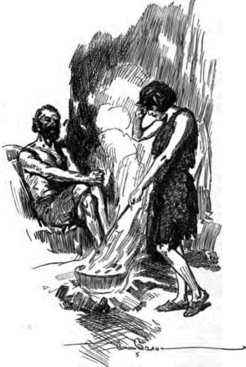
"THERE SHE WAS BOILING FISH-CHOWDER IN A SOOT- COVERED POT"