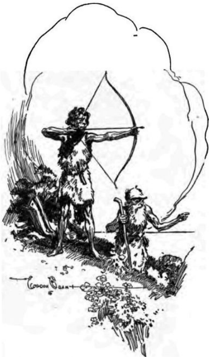
SLOWLY HE PULLED THE BOWSTRING TAUT