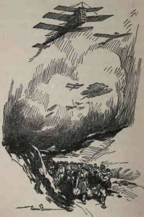
"POURING OUT OF THE CITY BY MILLIONS"

"The man who sent this news, the wireless operator, was alone with his instrument on the top of a lofty building. The people remaining in