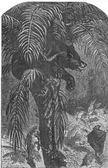
Bruin and the Dummy

strengthen this resemblance. A less distinctive name is that by which it is known to the French naturalists, "ours de jongleurs," or "juggler's bear." Its grotesque appearance makes it a great favourite with the Indian mountebanks; but, as many other species are also trained to dancing and monkey-tricks, the name is not characteristic.