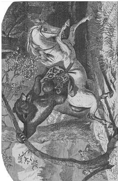
Ursus Thibetanus on Horseback

have a prominent place. He spends much of his time in searching for these —scratching them out of their holes, and turning over stones to get at them. Great boulders of rock, that a man could not move, he will roll over with his muscular arms; and large tracts of ground may be seen with the stones thus displaced.