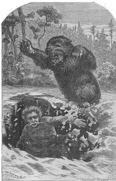
The Hunter Hunted

The chase led across the ravine, and of course over the bed of snow. The pursued was doing his best to escape. But the pursuer had the advantage—for while the man was breaking through at every step, the broad-pawed quadruped glided over the frozen crust without sinking an inch.