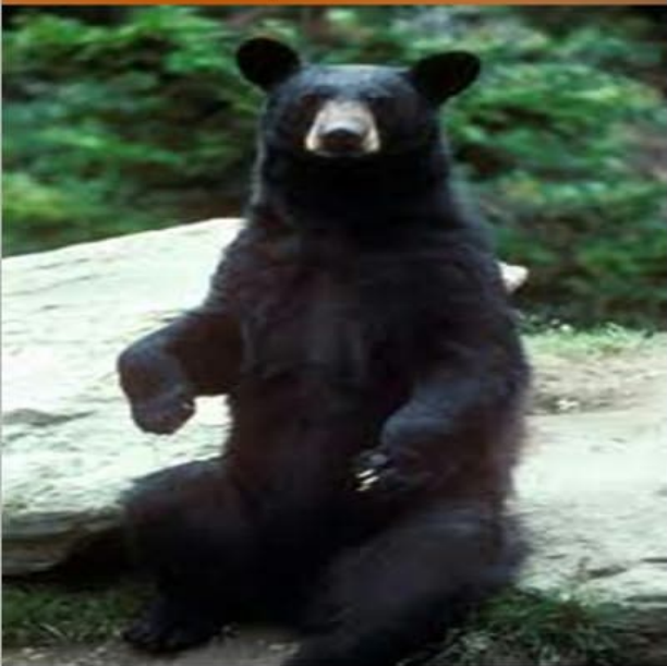
Captain Mayne Reid