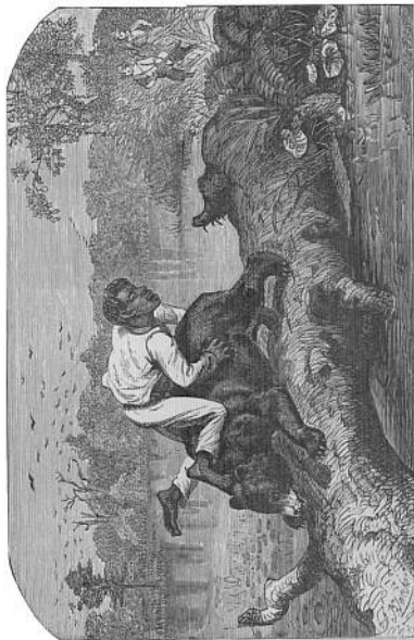
Blackie on Bear's Back

almost starting from their sockets, was endeavouring to retreat backwards, and get out of the way.