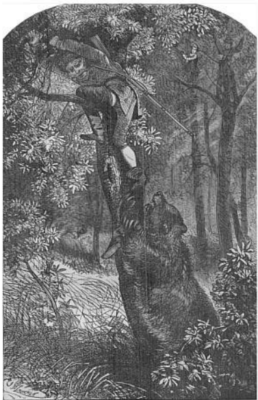
Pouchskin's Adventure with the Grizzly Bear