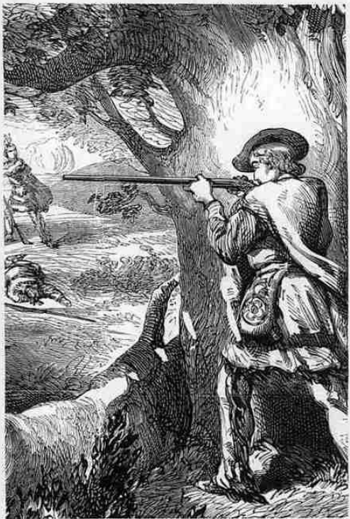
THE WHITE SQUAW.