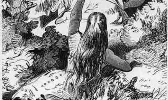
THE WHITE SQUAW.