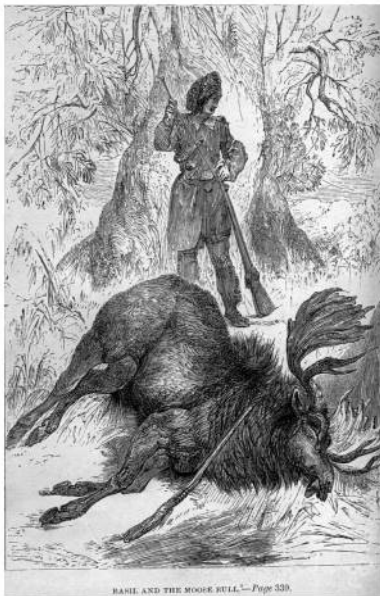
BASIL AND THE MOOSE KILL.—Page 339.

the strap of his bullet-pouch, he spliced the knife and