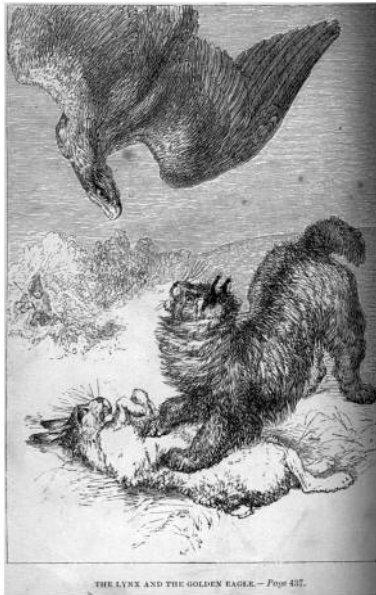
THE LYNX AND THE GOLDEN EAGLE.—Page 437.

young one of the white-headed kind—for, as you are aware, these do not have either the white head or tail until they are several years old. Its immense size, however, showed that it could not be one of these. It must be the great ' golden ' eagle of the Rocky Mountains, thought I.