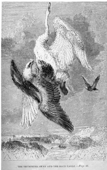
THE TRUMPETER SWAN AND THE BALD EAGLE.—Page 46.

of the broad river, and that the eagles did not wish, as it would have given them some trouble to get the heavy carcass ashore. As soon as the male—who was lower in the air—saw that his partner had struck the bird, he discontinued his upward flight, and, poising himself on his spread tail, waited its descent. A single instant was sufficient. The white object passed him still fluttering; but the moment it was