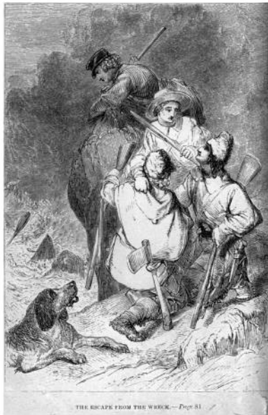
THE ESCAPE FROM THE WRECK.—Page 81