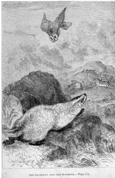
THE BLAIREAU AND THE MARMOTS.—Page 231.

partridge, reconnoitre a moment, and then go on again. Its design appeared to be to get between the marmots and their burrows, intercept some of them, and get a hold of them without the trouble of digging them up—although that would be no great affair to it, for so strong are its fore-arms and claws that in loose soil it can make its way under the ground as fast as a mole.