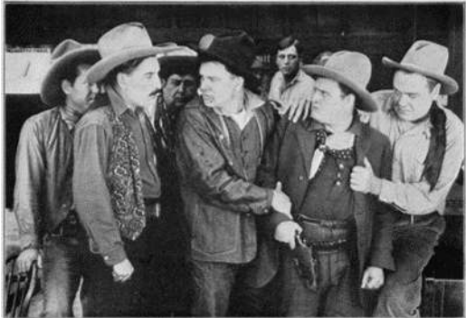
SCENE FROM THE PHOTO-PLAY PRODUCTION OF "WHISPERING SMITH."

"Bucks told him," continued Bill Dancing, in corroborative detail, "that when he got to Medicine Bend one man would be waiting for to meet him. 'He met me,' says Bucks; 'he's met every superintendent since my time; he'll meet you. Go right up and speak to him,' Bucks says; 'it'll be all right.'"