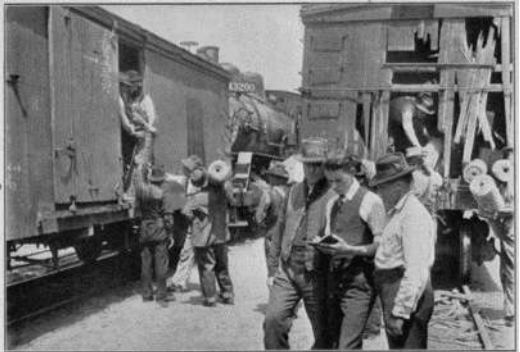
SCENE FROM THE PHOTO-PLAY PRODUCTION OF "WHISPERING SMITH."

Dawn showed in the east. The men eating breakfast in tents were to be sent on a work-train up a piece of Y-track that led as near as they could be taken to where they were needed. The train had pulled out when Dicksie, Marion, McCloud, and Whispering Smith took horses to get across to the hills and through to the ranch-house. They had ridden slowly for some distance when McCloud was called back. The party returned and rode together into the mists that hung below the bridge. They came out upon a little party of men standing with lanterns on a piece of track where the river had taken the entire grade and raced furiously through the gap. Fog shrouded the light of the lanterns and lent gloom to the silence, but the women could see the group that McCloud had joined. Standing above his companions on a pile of ties, a tall young man holding a megaphone waited. Out of the darkness there came presently a loud calling. The tall young man at intervals bawled vigorously into the fog in answer. Far away could be heard, in the intervals of silence, the faint clang of the work-train engine-bell. Again the voice came out of the fog. McCloud took the