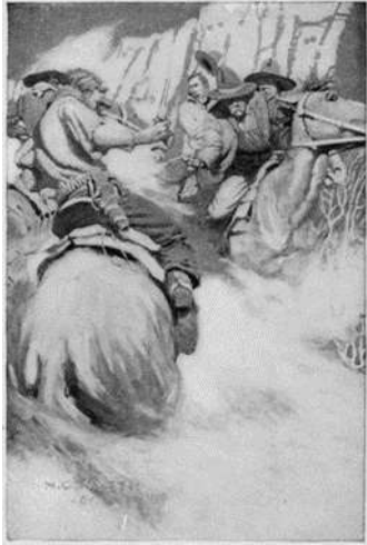
Wheeling at arm's length, shot again.

More serious than all, Smith found himself among three fast revolvers, working from an unmanageable horse. The beast tried to follow the fleeing cowboys, and when faced sharply about showed temper. The trained horses of the outlaws stood like statues, but Smith had to fight with his horse bucking at every shot. He threw his bullets as best he could first over one shoulder and then over the other, and used the last cartridge in his revolver with Du Sang, Seagrue, and Karg shooting at him every time they could fire without hitting one another.