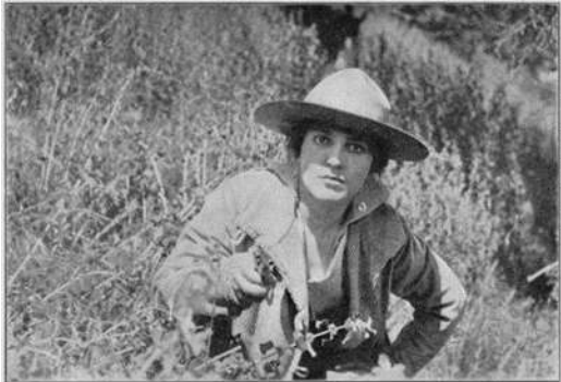
HELEN HOLMES AS MARION SINCLAIR IN THE PHOTO-PLAY PRODUCTION OF "WHISPERING SMITH."

He went back, dinnerless, to work all night; but the switchbacks were doing capitably, and all night long, trains were rolling through Medicine Bend from the West in an endless string. In the morning the yard was nearly cleared of westbound tonnage. Moreover, the mail in the morning brought compensation. A letter came from Glover telling him not to worry himself to death over the tie-up, and one came from Bucks telling him to make ready for the building of the Crawling Stone Line.