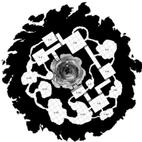
CRATER MAP LEVEL 1

The basket settles at the first lift dock. Hidden in the shadows of the landing are 2 kobolds that have been alerted by the descent of the basket. Likewise if kobolds have escaped from one of the kobold caverns, double this number is lying in wait. As soon as the basket is within ten feet of the landing, the kobolds open fire with shortbows. As the characters reach the landing, the kobolds retreat to area 1-2 and eventually through the Kobold Highway to their warrens. Unless dispatched quickly, one of the kobolds always attempts to flee towards Area 1-2 and beyond to Area 1-14 where further runners are sent throughout the warren to set traps and activate guard patrols. The second way that the kobolds may be alerted to the presence of the