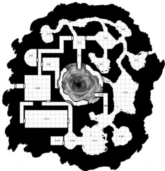
CRATER MAP LEVEL 3

already joined in forcing the characters out of the kobold lair or have joined Skritch in the Throne Room: Area 2-14 and prepare to guard their rulers escape.