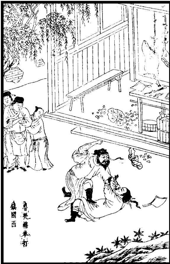
Lu Da sorts out the bullying butcher, Zheng.

Horses, though more widespread than in the past, are still quite rare, as the best ones are bred by the barbarians beyond the borders. A character may have as many horses as his wealth bonus, assuming the horses are of poor quality (for example, a donkey). As with weapons, for each additional point of wealth , a character may either have an additional horse or improve the quality of a horse by one step: from poor to average to good to fine.