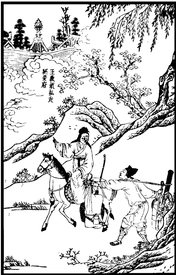
Wang Jin and his mother escape from the Capital after Gao Qiu is installed as commander of the Imperial Guard

There are several other ways to create a character for yourself. The easiest way is to take one of the Water Margin characters or sample character types listed in the Extras chapter. If you're not entirely satisfied with it, you'll have to go through and change the details to suit yourself. If you do change details you should be careful to check the relevant section in this chapter. Then, choose a name and flesh out the background to make the character truly yours. Alternatively, have a look at the Simple Character Creation box on this page. This suggests a way of developing a character while you play the game. That way you don't have to spend hours pondering over them before the game, but can 'make it up as you go along'.