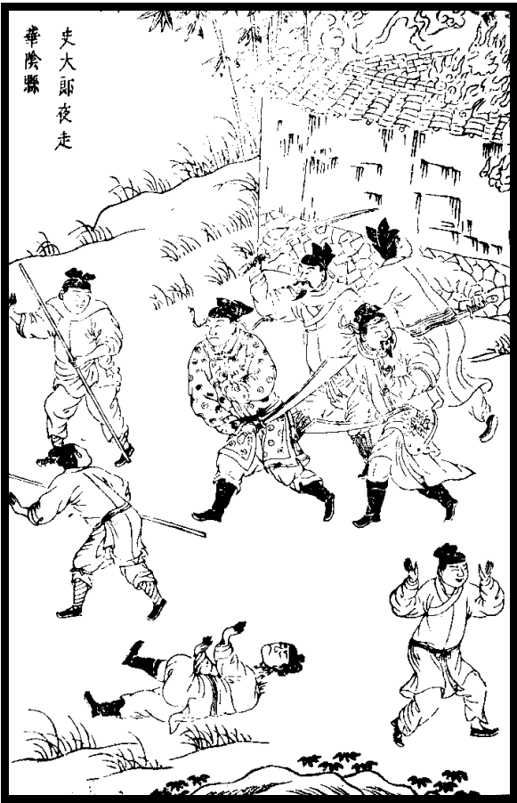
The chivalrous sergeants Flying Tiger and Beautiful Whiskers help Shi Jin escape the sheriff.

The referee will have to interpret these relative levels. Obviously it will always be necessary to think up some details about the person with whom the character has a relationship: at the very least a name. The referee is at liberty to use that person in the course of a game.